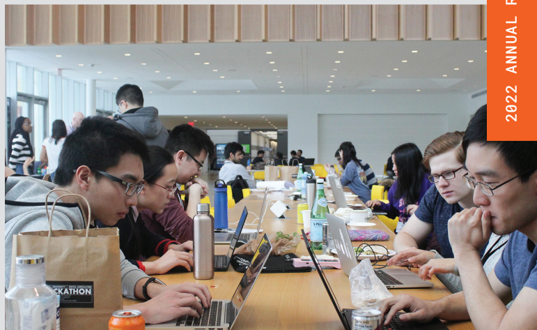
Students from across the university race the clock, collaborating to solve DA challenges at our annual Hackathon.